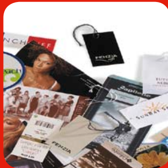
Apparel Labelling Solutions