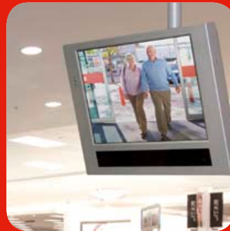
Video, Alarm and Monitoring Services