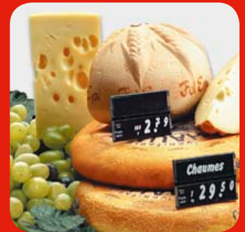
Retail Merchandising Solutions